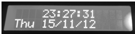
Figure 18-4: Display from Project 58

The operation of this sketch is similar to that of Project 57, except in this case, we've altered the function displayTime to send time and date data to the LCD instead of to the Serial Monitor, and we've added the setup lines required for the LCD at ❶ and ❷. (For a refresher on using the LCD module, see Chapter 7.) Don't forget to upload the sketch first with the time and date data entered at ❸, and then re-upload the sketch with that point commented out. After uploading the sketch, your results should be similar to those shown in Figure 18-4.