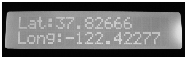
Figure 13-7: Latitude and longitude display from Project 44

After the sketch has been uploaded and the GPS starts receiving data, your current position in decimal latitude and longitude should be displayed on your LCD, as shown in Figure 13-7.