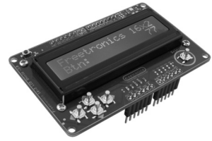
Figure 13-6: The Freetronics LCD & Keypad shield

Now let's create a simple GPS receiver. But first, because you'll usually use your GPS outdoors—and to make things a little easier—we'll add an LCD module to display the data, similar to the one shown in Figure 13-6.